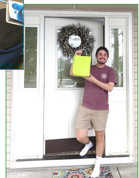
HS Senior Care Packages